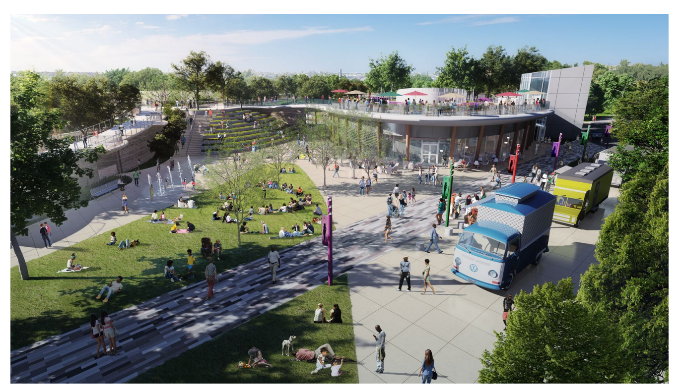
This rendering of Phase One of the Southern Gateway deck park in Dallas shows the multi-purpose building, the 12th Street Promenade, running from the bottom left of the rendering toward the multipurpose building, and the terraced seating area. (HMK Architects/SWA Group)

The children's playground is a great example of the commitment by HKS and SWA to be authentically Oak Cliff. McDaniel described it as "a playhouse in the woods," with equipment built of natural materials and a floor inlaid with giant leaves and identifying information.